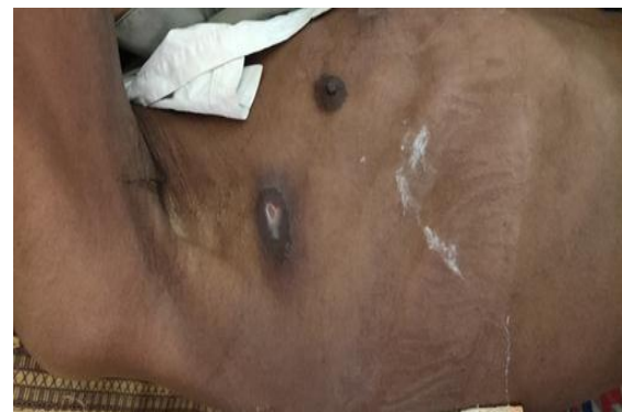
Figure 1: Showing a lump with discharging sinus on right lateral chest wall over the mid-axillary line with thick muddy yellowish discharge oozing out of it.

On examination patient was moderately built, respiratory rate is 29/min, PR 75/min, spo2 88% on air. On general examination Pallor and clubbing was present. Respiratory examination on inspection revealed a lump with discharging sinus on right lateral chest wall over the mid-axillary line with thick muddy yellowish discharge oozing out of it. [Figure 1].