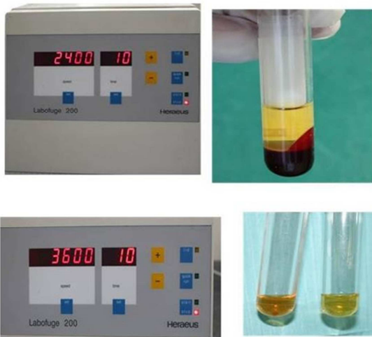
Figure 2: Centrifugation