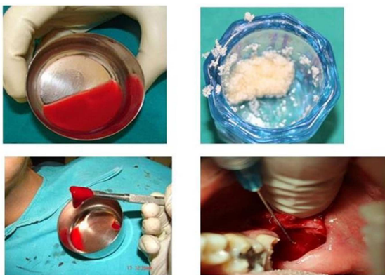
Figure 3: Graft Placement at the site