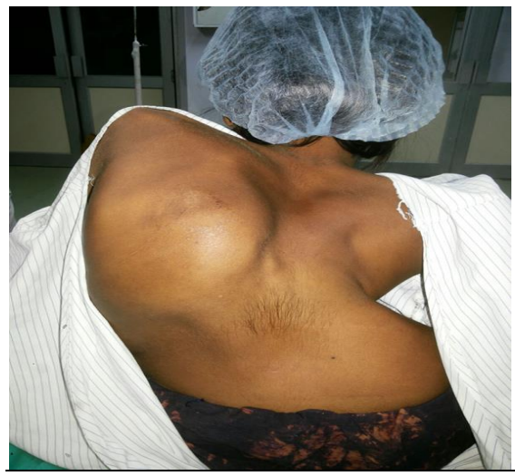
Figure 1: A fixed spine deformity with forward bending at thoraco-lumbar region.

the different paths of the femoral, lateral cutaneous, obturator, common peroneal, and tibial nerves. The surgery and anesthetic outcomes were uneventful under femoral and sciatic nerve block and surgery was conducted successfully under this block.