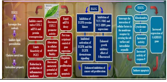
Figure 3: Anticancer effects of EGCG.

In addition, EGCG can also influence epidermal receptor-mediated growth factor signal transduction pathway. Over-expression of growth factor and growth factor receptors such as EGF receptor (EGFR), PDGF-Receptor (PDGFR) and others can result in a neoplastic phenotype in tumor cells.<sup>[3]</sup> It has been reported that EGCG enhances growth inhibitory effects of 5-fluorouracil by inhibiting YCU-N861 and YCU-H891 gene expression. Studies suggest that EGCG inhibits activation of EGFR and the EGFR downstream signaling by inhibiting EGFR tyrosine kinase. These mechanisms lead to enhanced inhibition of cancer cell proliferation [Figure 3].<sup>[1]</sup>