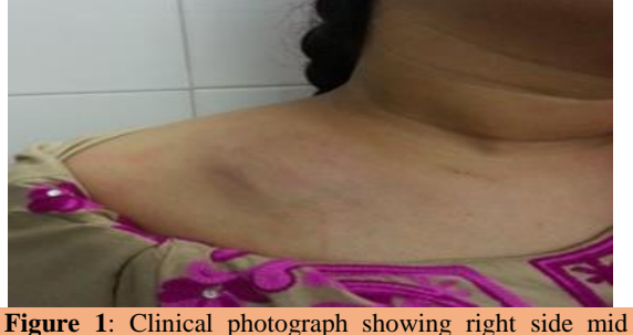
Figure 1: Clinical photograph showing right side mid clavicular swelling.

A14 year female presented to orthopedics outpatient department with history of pain and swelling over right clavicular region since 6 months [Figure 1]. Pain was insidious in onset, continuous and mild in intensity. It used to subside with medications. It was associated with small swelling which patient ignored for last four months. There was no history of trauma. There was history of low grade fever off and on which used to subside on taking medication. From last one month pain and size of swelling increased suddenly with painful movement of shoulder which leads the patient to visit orthopedics outpatient department.