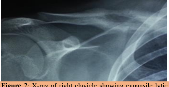
Figure 2 : X-ray of right clavicle showing expansile lytic lesion, with sclerosed margins.

Plain radiograph of right clavicle anteroposterior view shows expansile mid clavicular lytic lesion with sclerosed margins [Figure 2].MRI shows mildly expansile intramedullary altered intensity in mid clavicle region with evidence of cortical breach extended to adjacent soft tissue with periosteal reaction. It also shows post contrast enhancement with central necrotic zones suggestive of Ewing sarcoma and was advised biopsy correlation.