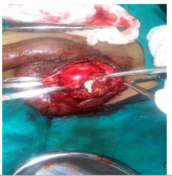
Figure 2 : surgical instruments holding dartos, tunica vaginalis and tunica albuginea on either side

Scrotum was explored in layers and dead and necrotic tissue debrided. The testis and the scrotum were kept open. Biopsy samples from the abscess cavity wall were sent for histopathology and pus samples sent for routine culture and acid fast bacilli staining. The culture showed no growth, however the pus stained positive for acid fast bacilli. Biopsy report suggested mixed inflammatory infiltrate with granuloma formation, epithelioid and plasma cells [Figure 3]. Patient was started on category II anti tubercular chemotherapy in the post operative period. The wound was managed with daily dressings and granulated well. Secondary suturing was performed on the 15th post operative day and sutures removed after another 15 days. Patient was followed up till six months post operatively and an ultrasound and Doppler study at six months showed an atrophic but viable left testis.